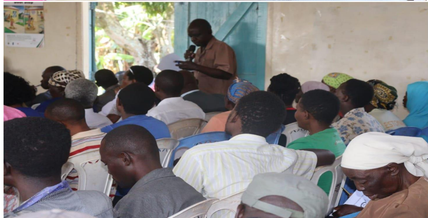
Stakeholders giving their views on the municipal board activities.