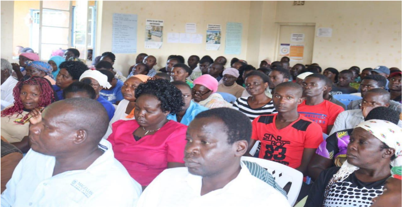
Stakeholders at Community Justice Center