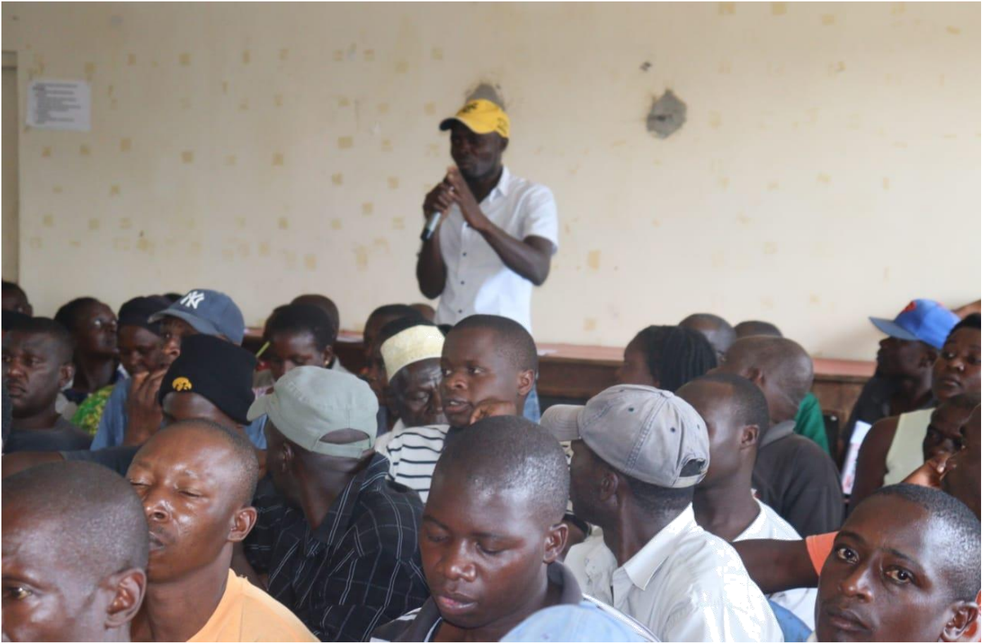
A bodaboda operator at Majengo market giving views at Community Justice Centre