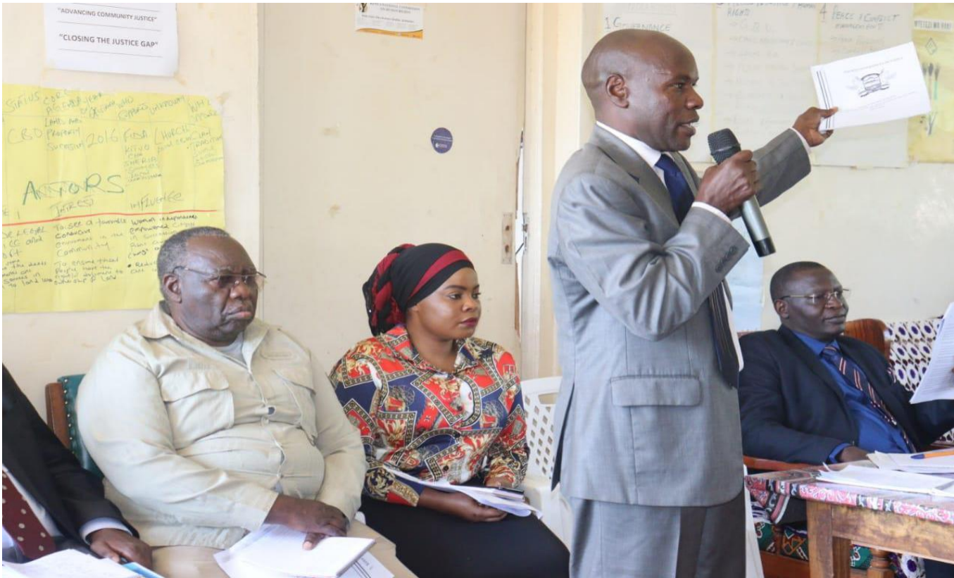
Chair to the technical committee presenting urban investment plan for financial year 2019/2020