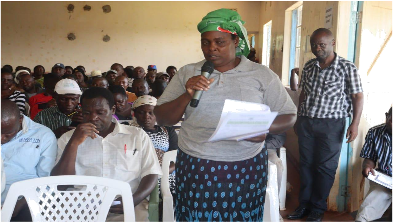
A stakeholders express concerns during the plenary session at Community Justice Center.