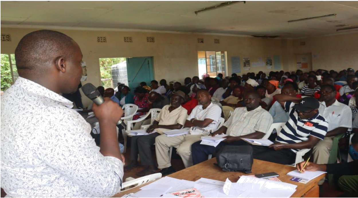
The municipal planner makes a presentation of the projects implementation for the financial year 2018/2019