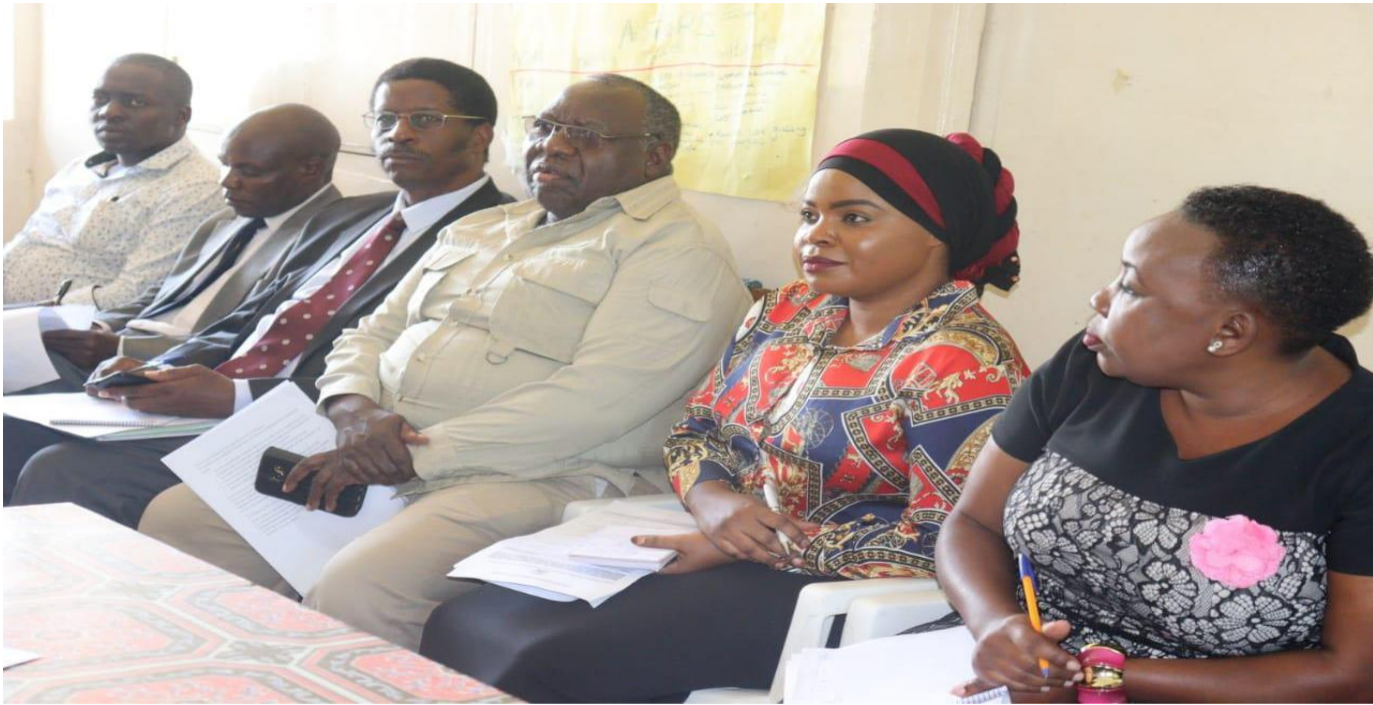
Municipal board Members at Community Justice During the citizen engagement forum